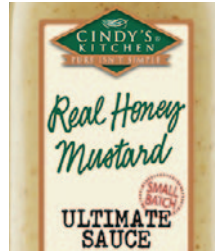
Real Honey Mustard #283258 2/1 gal.