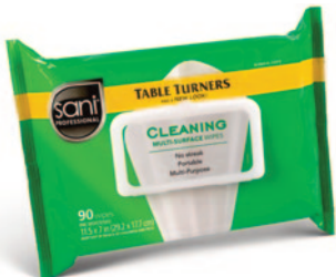
Table Turner Surface Wipes

- Food safe formulation. Safe on ALL hard and soft surfaces including wood, leather and laundry.