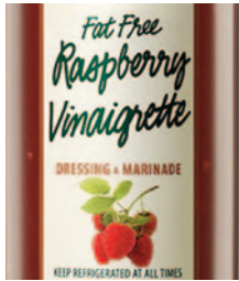
Raspberry Nectar Vinaigrette #283250 2/1 gal.