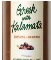
Greek Vinaigrette w/ Kalamata #283264 2/1 gal.