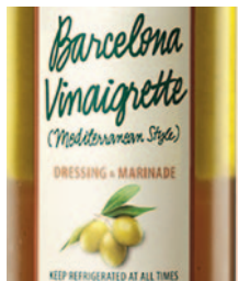
Barcelona Vinaigrette #283262 2/1 gal.