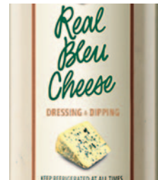
Real Bleu Cheese #283266 2/1 gal.