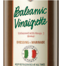
Balsamic Vinaigrette #283260 2/1 gal.