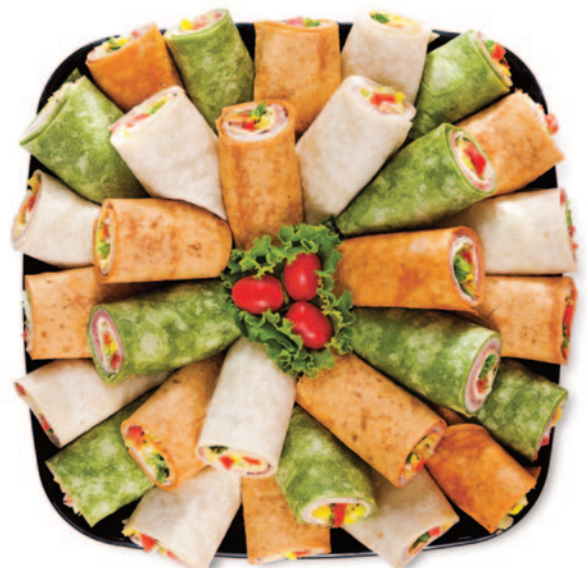
Herb Garlic Pesto Wraps 12" #331712 6/12 ct.