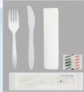
White Medium Weight Fork, Knife, Napkin, Salt & Pepper #544025 1/250 ct. 5-1