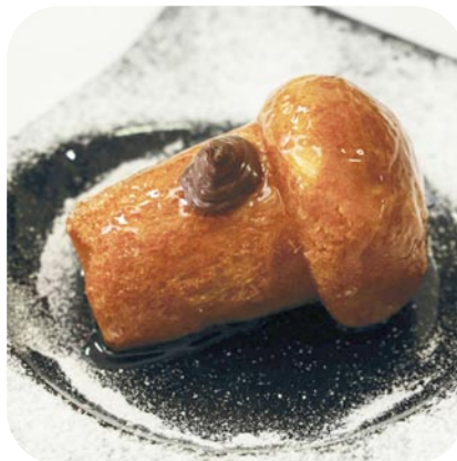
Neopolitan Rhum Baba

Delicate ricotta and Williams pear cream enclosed in two hazelnut biscuits.