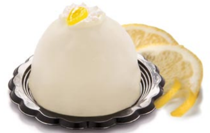
Lemon Delizia Sponge Cake