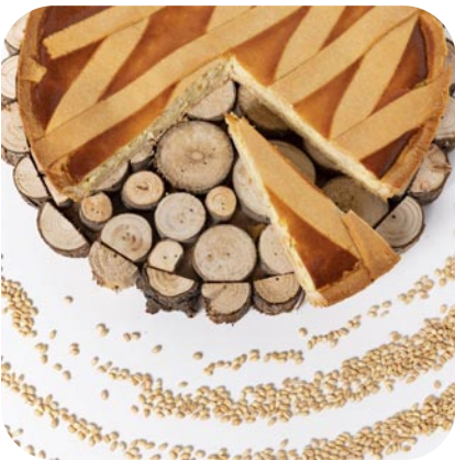
Pastiera Whole Cake

The lemon delights are famous sweets of Campania origin formed by a soft dome of sponge cake and a tasty Sorrento lemon cream