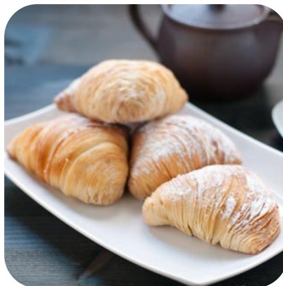
Neopolitan Small Sfogliatelle

Shortcrust pastry cake filled with a mixture of ricotta, sugar, eggs, candied citrus peel and wheat boiled in milk, scented with orange blossom.