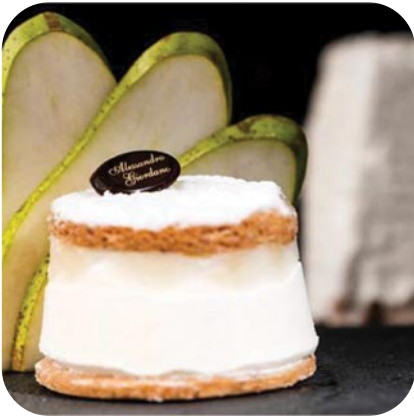
Ricotta & Pear Cake

Giordano is an artisan pastry and biscuit workshop. These desserts are prepared following the recipes of the ancient Campania, Calabrian and Sicilian pastry tradition.