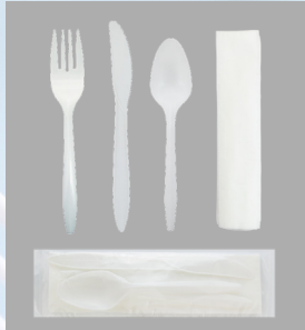
White Medium Weight Fork, Knife, Spoon, Napkin #544002 1/250 ct. 4-1