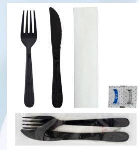
Black Heavy Weight Fork, Knife, Napkin, Salt & Pepper #544003 1/250 ct. 5-1