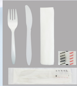
White Medium Weight Fork, Knife, Napkin, Salt & Pepper #544025 1/250 ct. 5-1