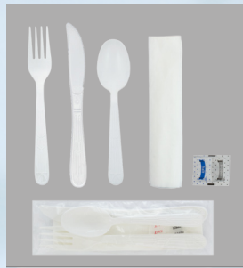
White Heavy Weight Fork, Knife, Spoon, Napkin, Salt & Pepper #544006 1/250 ct. 6-1