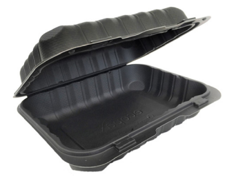
Hinged Container Black Pebble 1Comp