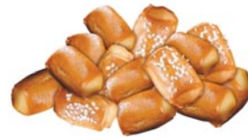
Pretzel Bites #523179 1/350 ct.