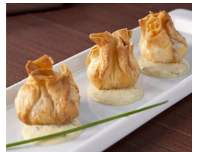
Fig & Mascarpone Beggar's Purse

Chicken breast strips are coated in waffle batter, infused with a rich pecan flavor, and seasoned with Nashville's signature hot chicken spice. Drizzled with pancake and waffle syrup, each skewer is then breaded in fluffy Belgian waffles.