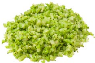
Diced Broccoli Riced

Pre-cut produce is a great way to save labor and time. These fresh, ready-to-use products offers consistency and safe food handling. Great for so many applications. Ask your DiCarlo Sales Consultant about additional pre-cut produce items we stock.