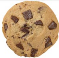
Chocolate Chunk Supreme Cookie Dough #485320 108/3 oz.