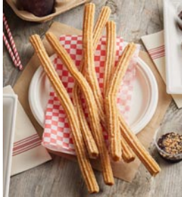
California King Size Churros 16" #70203 100/16"