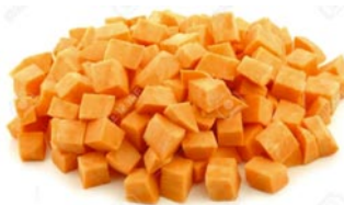
Sweet Potato Diced 1"