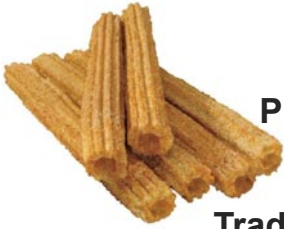
Plain Churros 10" #70200 100/10"