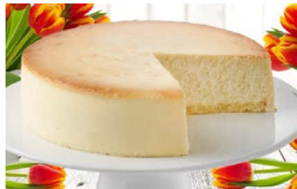
Original Cheesecake 10" #341905 2/14 slice New York cheesecake, smooth and creamy. Pure and simple, made only with the finest ingredients: cream cheese, sugar, eggs and heavy cream. Thin layer of yellow cake on the bottom.