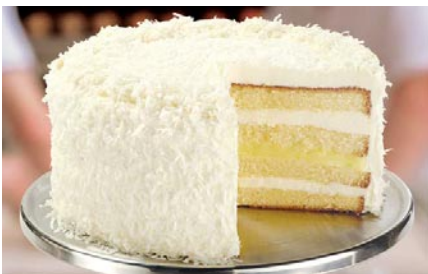
Lemon Coconut Layer Cake #341907 1/10" cake Layers of moist yellow cake with lemon buttercream and lemon creme filling. Covered in angel flake coconut.