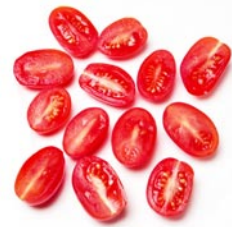
Sliced Grape Tomatoes