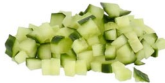
Diced Cucumber 3/8"