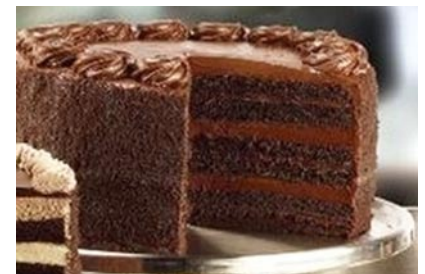
Chocolate Fudge Layer Skyscraper Cake #341900 1/14 slice Layers of moist, rich chocolate cake with chocolate fudge filling. The sides are covered with chocolate crumbs, decorated with chocolate fudge with dollops.