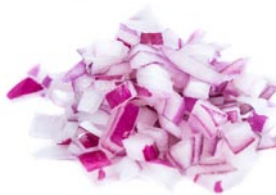
Red Onions Diced