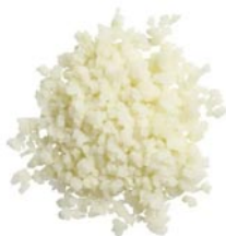
Fresh Riced Cauliflower