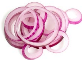
Red Onions Sliced/Slivered