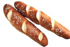
Bavarian Pretzel Stick 2.4 oz. #519932 72/2.4 oz.