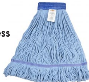
Blue Looped Cotton Mop Head #548826 6 mops