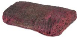
Brillo Steel Wool & Soap Pad #548200 12/10 pads