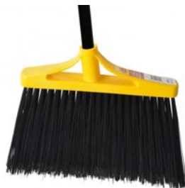
Large Angle Broom w/ Black Bristles #548820 24 brooms