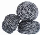
Stainless Steel Scrubber #548250 6/12 pc.