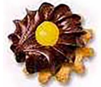
Fudge M&M Cookie #480042 1/5 lb.