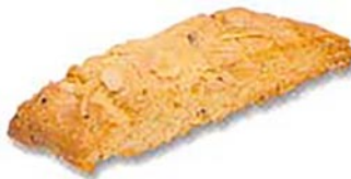
Almond Biscotti Cookie #480038 1/5 lb.