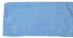
Blue Microfiber Towel 16x16" #800135 24 towels