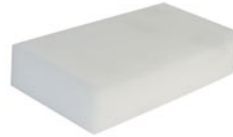
Melamine Sponge Magic Eraser #548817 24 pads