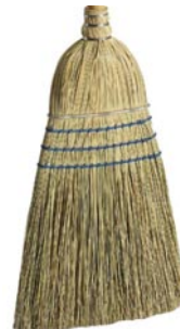
Warehouse Corn Broom #548828 12 brooms