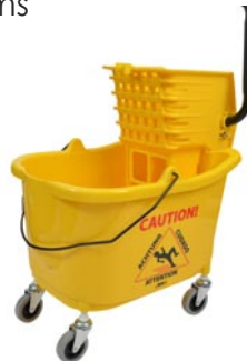
Bucket & Side Press Ringer Combo #548814 1 ea.