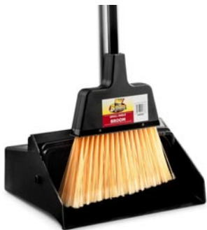
Lobby Dust Pan with Broom #548815 1 ea.