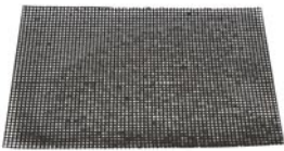
Griddle Screen 4x5.5" #548810 1/200 ct.