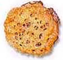
Florentine Lace Cookie #480036 1/5 lb.