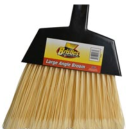
Large Angle Broom w/Metal Handle #548818 24 brooms