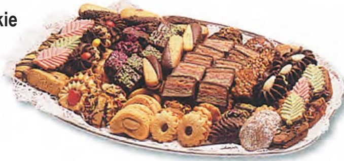
Assorted Cookie Tray #480034 1/5 lb.