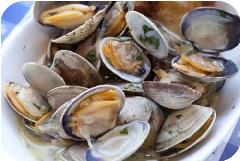
Mid Neck Clams 1"- up at hinge (7-9 per pound) #242608 1/100 ct.