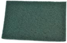
Scouring Pad Heavy Duty 6x9" #548812 6/10 pk.