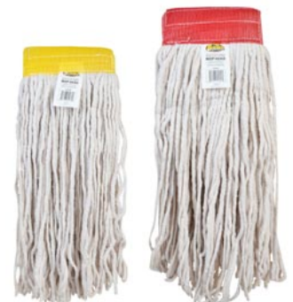
Cut End Mop Head #32 #32 #548824 4 mops #24 #548822 4 mops