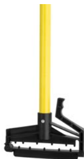
Mop Stick 60" Quick Release Yellow #548832 6 handles