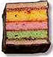
Marizpan Rainbow Cookie #480030 1/5 lb.