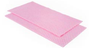
Handi Wipe Towels 12x24" Pink & White #549587 1/200 ct. Blue & White #549588 1/200 ct.