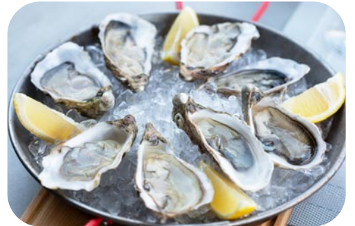
Sewansecott Oysters #242588 1/100 ct.