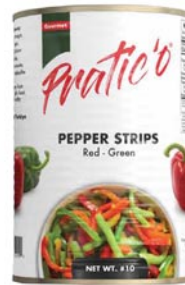
Red & Green Pepper Strips #35705 6/#10