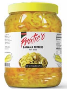
Sliced Hot Banana Peppers #304314 4/1 gal.