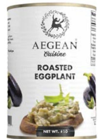
Roasted Eggplant #190688 6/#10