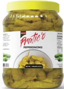
Pepperoncini #302250 4/1 gal.