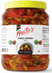
Sliced Red & Green Hot Cherry Peppers #304313 4/1 gal.