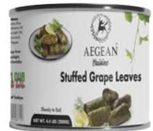
Stuffed Grape Leaves Dolmades #304445 6/#10