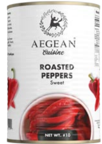
Whole Roasted Red Peppers #190676 6/3 kg.