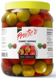
Red & Green Cherry Peppers #304312 4/1 gal.