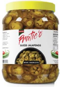
Sliced Jalapeños #303502 4/1 gal.