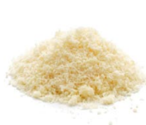
Grated #15177 4/5 lb.