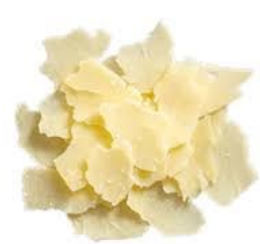
Shaved #18480 4/5 lb..