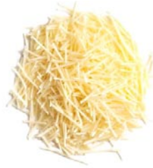
Shredded #15065 4/5 lb.