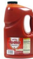
FRANK'S RedHot Original RedHot Sauce #401880 4/1 gal.