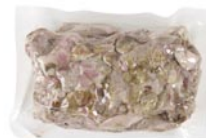
Pulled Pork Unsauces Ckd #143052 2/5 lb.