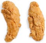
Chicken Tender Fritter 2 oz. #122024 2/5 lb. Raw