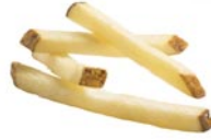
Conquest Delivery Fries Skin-on 3/8" #42917 6/5 lb.