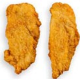
Lightly Breaded Chicken Tender 2oz. #122022 2/5 lb. Raw