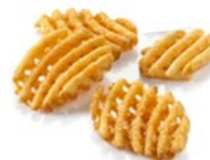
Seasoned Lattice Fries #42875 6/4 lb.