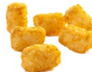
Tater Tots #42872 6/5 lb. ovenable