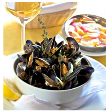
Fresh Rope Farmed Organic Mussels #242565 5/10 lb.