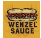
Wenzel Hot Wing Sauce #401855 4/1 gal.