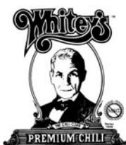
Beef Chili with Beans #143800 4/5 lb.

Loaded with creamy cheddar cheese, sour cream, and potatoes.