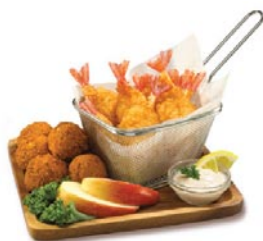
Breaded Butterfly Shrimp 16-20 ct. #246301 4/3 lb. 21-25 ct. #246303 4/3 lb.