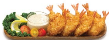
Coconut Breaded Butterfly Shrimp 16-20 ct. #246305 4/3 lb.