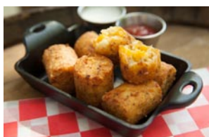
Bacon Cheddar Tater Kegs #42230 106/1.5 oz.

Loaded with creamy cheddar cheese, big bacon bits, sour cream and chives.