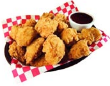
Boneless Breaded Chicken Wings Raw #122030 2/5 lb.