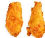
Spicy Breaded Chicken Wings Zings #124065 3/5 lb. Ckd