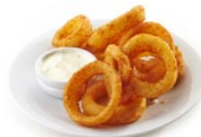
Battered Onion Rings 3/8" #43102 4/2.5 lb.