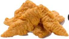
Breaded Golden Chicken Tender Raw #122027 2/5 lb.