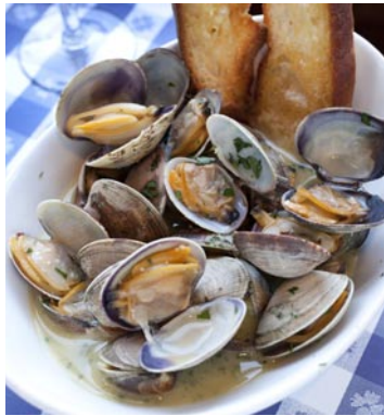
Fresh Mid Neck Clams #242608 1/100 ct.