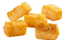
Seasoned Skin on Diced Potatoes 3/4" #42794 6/5 lb.