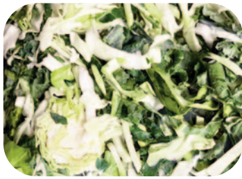
Super Greens Salad Mix shredded kale, broccoli & green cabbage, sliced brussel sprouts #3066 8/2.5 lb.