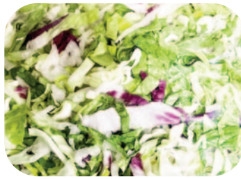
Splendid Greens Salad Mix romaine, escarole, chickory, napa & radicchio #3064 8/2 lb.