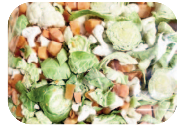
Seasonal Vegetable Blend for Roasting cauliflower, carrots & brussel sprouts #3068 4/5 lb.