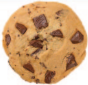
Chocolate Chunk Supreme Cookie Dough #485320 108/3 oz.