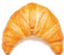
All Butter Curved Croissant Raw #335921 60/3.17 oz.

Croissant with a crispy exterior and airy interior that melts in your mouth. Ideal to enjoy pure or as a carrier for your savory or sweet toppings. Great for breakfast or lunch!