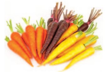
Rainbow Carrots Item# 228 24/2 lb.