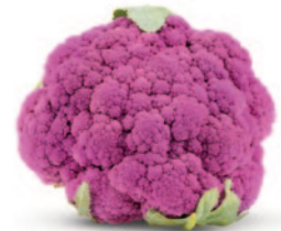
Purple Cauliflower Item# 1220 1 case