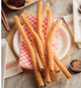
California King Size Churros 16" #70203 100/16"