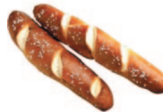
Bavarian Pretzel Stick 2.4 oz. #519932 72/2.4 oz.