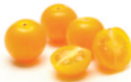
Yellow Cherry Tomatoes Item# 857 1 box