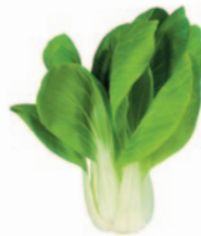
Bok Choy Item# 165 1 crate