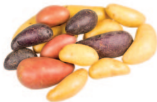
Tri Color Fingerling Potatoes Item# 379 1/10 lb.