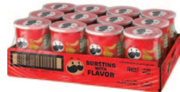
Pringles Original #519736 12/1.3 oz.