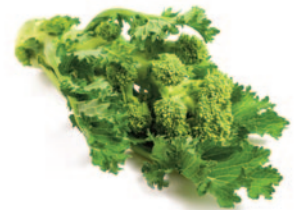
Broccoli Rabe Item# 182 1 crate