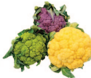
Tri-Color Cauliflower Item# 227 1 case