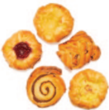
Assorted Mini Danish Raw 1.5 oz. #335911 120/1.5 oz.

A sweet selection of different mini Danish crowns. 24 Each: Custard Cream, Apple, Raspberry, Maple Pecan & Cinnamon Swirl.