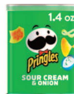
Pringles Sour Cream & Onion #519738 12/1.3 oz.