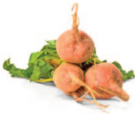
Golden Beets Item# 163 1 bag