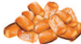
Pretzel Bites #523179 1/350 ct.