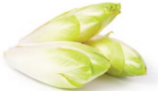
Belgian Endive Item# 330 1/10 lb.