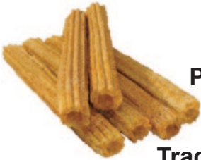
Plain Churros 10" #70200 100/10"