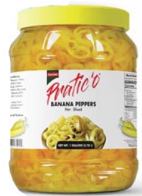
Sliced Hot Banana Peppers #304314 4/1 gal.