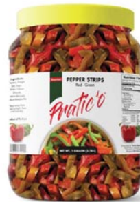
Red & Green Pepper Strips #35705 6/#10